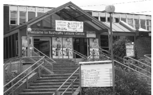
Future of Rushcliffe Leisure Centre - its location is under question.

Chaworth and South Road tree pollarding. The County is considering a proposal to do alternate trees so that the street scene is never totally bare.