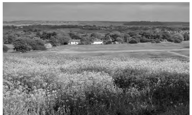
View of part of the site from the Wood to Melton Road

Your Liberal Democrat Focus Team and Councillors have opposed the plans to build on this skyline and hillside from the start.